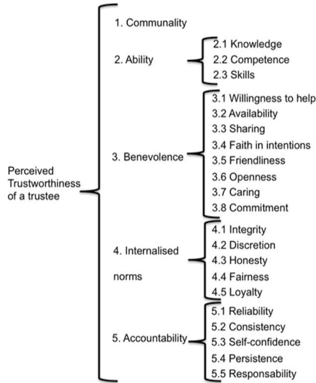
Fig. 1. Model for the schema of trustworthiness proposed in [11]