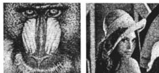
Figure 5. Results obtained by means of the proposed filter using the parameter values given in Table 1.