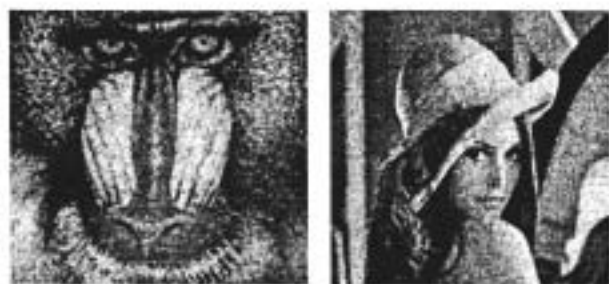
Figure 4. Results obtained by means of a 5x5 median filter