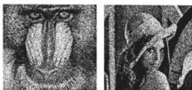
Figure 3. Noisy versions of the test images of Figure 2. Parameters of noise mixture: 5% impulsive noise, multiplicative Gaussian noise of variance 0.1