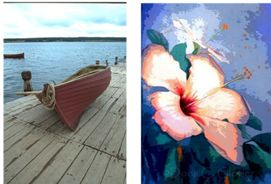
Fig. 1. A bitmap image classified into the class photography (P) [left part] and an example of an image not classified into this class [right part].

were inspired by requirements of many owners of digital cameras who want to automatically classify their databases of images. In the following text, each class t \in \mathcal{K} is described using a brief natural language expression d(t) . Images that belongs to the class and that do not are mentioned. Examples of positively and negatively classified images with respect to proposed classes are also shown.