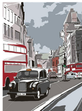
Fig. 2. An image classified into the class artistic image (A).