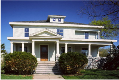
Fig. 3. An example of image classified by the user into the class buildings (B).

However, a building located in a landscape represents a positive example with respect to this class.