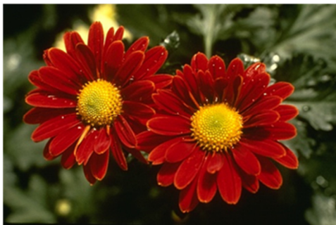
Fig. 5. An example of bitmap image classified as a macro object (M).

d(B) = “a photograph of an object from the small distance with blurred background“