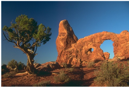
Fig. 4. Bitmap image classified into the class landscapes (L).

An example of an image depicting a landscape is shown in Figure 4. Images of artificial object are not classified into this class. On the other hand, an image of an artificial object placed in the landscape can represent a landscape as the whole.