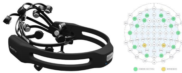
Fig. 3. Emotiv EPOC+ device, 14 signals and 10-20 system [30]